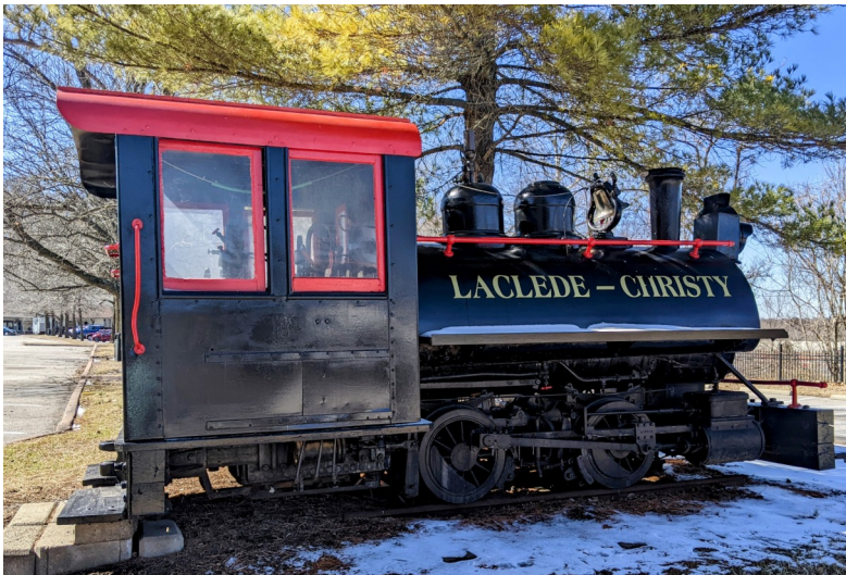
Left: the 1907 Laclede-Christy #2 built by Davenport Locomotive Works. This is a O-4-OT (Tank) 30" Narrow Gauge, coal-burning tank engine. It has 24" drivers and weighs 24,000 pounds. The original owner sold the engine to the brick-making company, Laclede-Christy Clay Products Company, who used it at their St. Louis plant moving carloads of clay to the brick factory. It was retired in 1952.