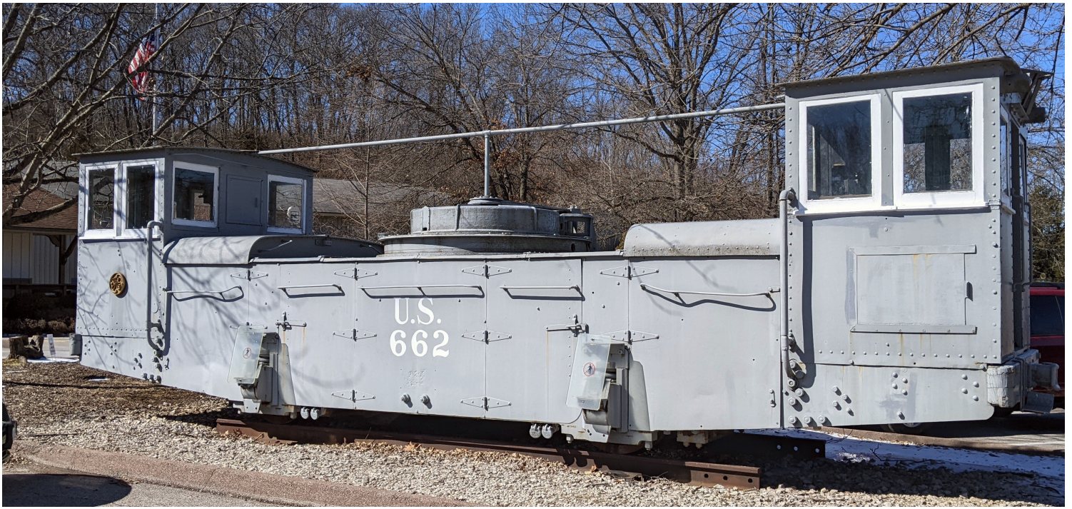
Above: the 1914 U.S. Mule #662 was built by General Electric. In 1914, to operate on the Panama Canal, 40 mules (named after the pack animal) were built by GE. They were used for side-to-side and braking control through the locks. Four mules were used per ship, one on each side and one on each end. They each cost $13,092 and were used on the Pacific side of the canal at the Pedro Miguel locks. They each weighed 86,300 pounds and were 32'-2 1/4" in length. The mule ran on 5' gauge rails.