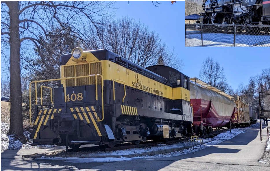
Left: The 1937 Sabine River & Northern Railway Locomotive #408, Diesel-electric Switcher Engine Model NC, was built by the Electro-Motive Corporation. Painted in Bumble Bee colors, the engine had a 900 horsepower Winston Model 201-A engine, cast frame, with top speed of 50 mph. It cost $91,500 and weighs 250,000 pounds.