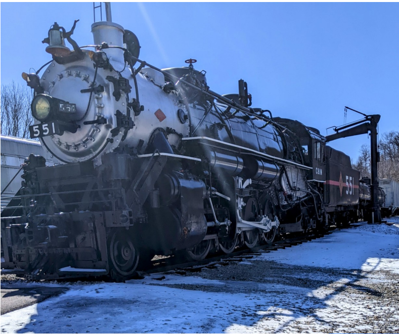
Left and below: The 1928 Chicago & Illinois Midland Railroad Steam Locomotive #551 was a 2-8-2 Mikado built by Lima Locomotive Works. Big and powerful, its name was changed from Mikado to McArthur during WWII. This engine powered coal trains from Illinois Midland Coal Mines to Commonwealth Edison Electric Generating Plants.