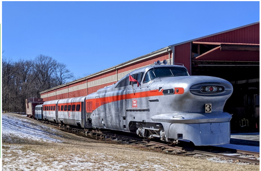
Right: 1955 Chicago, Rock Island & Pacific "Aero-train" #3 built by General Motors. They used lightweight construction concepts in the building of a futuristic locomotive and 10 cars, which resulted in the "Aerotrain." It was an attempt to lure passengers back to rail travel vs. air or automobile travel. Unfortunately, at high speeds the coaches rode very poorly and were very noisy since they were little more than widened bus bodies. The Chicago, Rock Island and Pacific ultimately used the trains as commuters from Chicago to Joliet, IL.