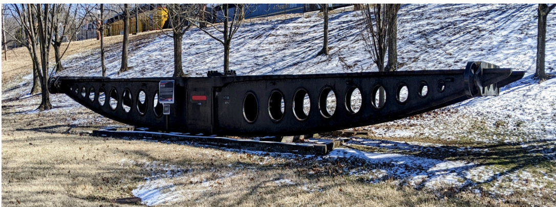
Below: This Sellers Turntable built in 1869 is the last-known example of a Sellers found in the United States. The turntable is one of the most iconic relics from the steam era of American railroading. It was the most efficient way to turn a steam locomotive around, using less space than any other method. Turntables were centered in front of a roundhouse.

Placed over a circular pit, the turntable platform was supported in the center by a pivot and had wheels on each end. One of the most notable makers of quality turntables was William Sellers & Co. of Philadelphia. Their unique design was made from cast-iron parts and first patented in 1848. Sellers' catalogs claimed one man "could turn it without the aid of machinery." By the early 20th